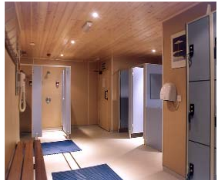
Separate washroom and kitchen block.

The Centre is accessible to all – people with mobility difficulties have no problem entering or moving around.